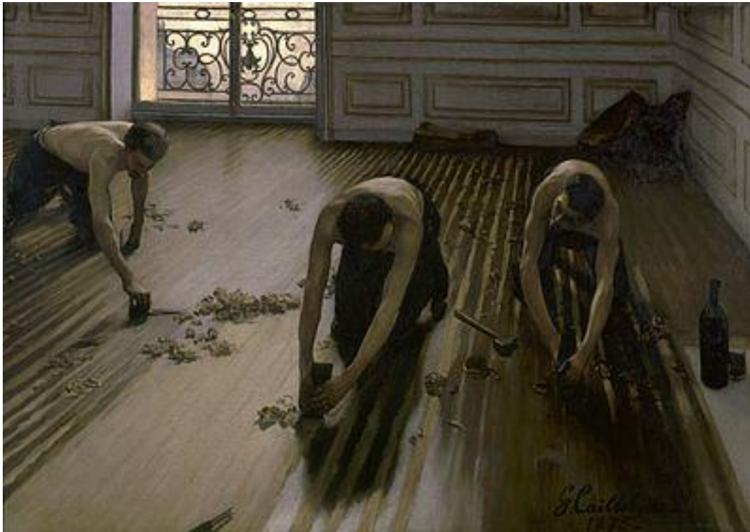
“Les Raboteurs de Parquet/ The Floor Scrapers” (1875)