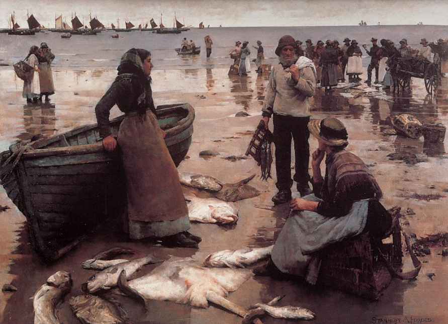
“Fish Sale on a Cornish Beach” (1885)