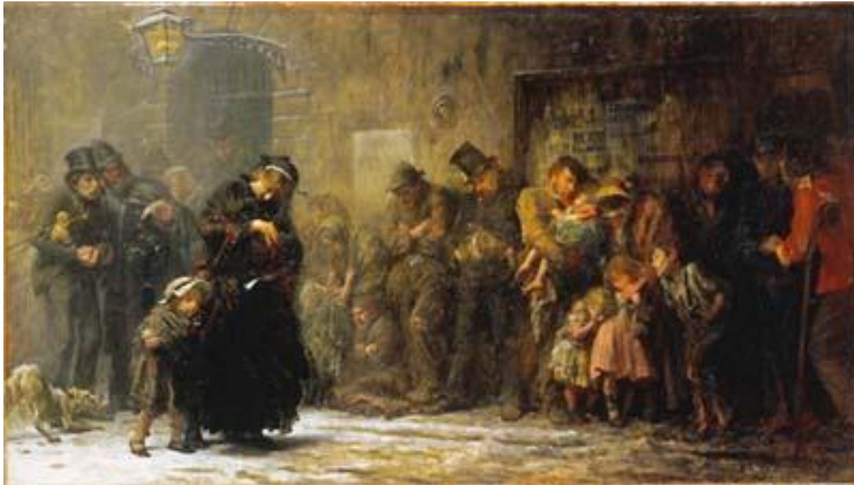
“Applicants for Admission to a Casual Ward” (1874)