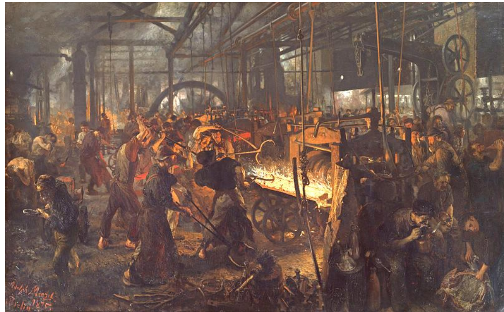
“The Iron-rolling Mill” (1875)