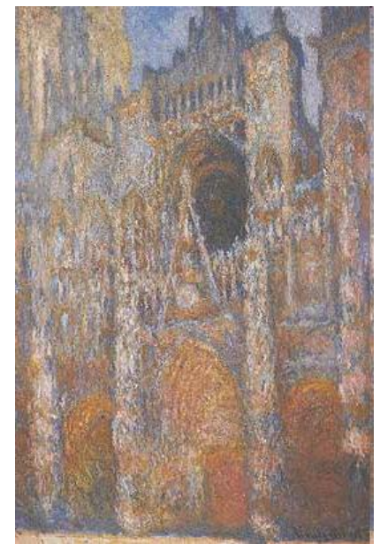
"Cathedrale de Rouen" (1894)