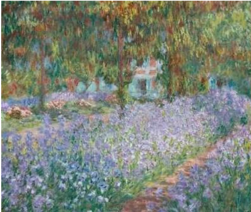
"The Artist's Garden at Giverny" (1900)