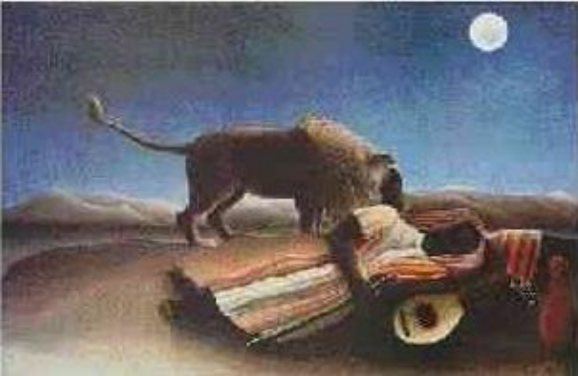
"Sleeping Gypsy" (1897)