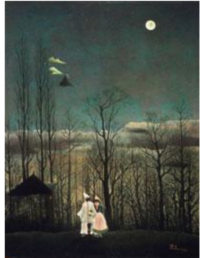
"Carnival Evening" (1886)