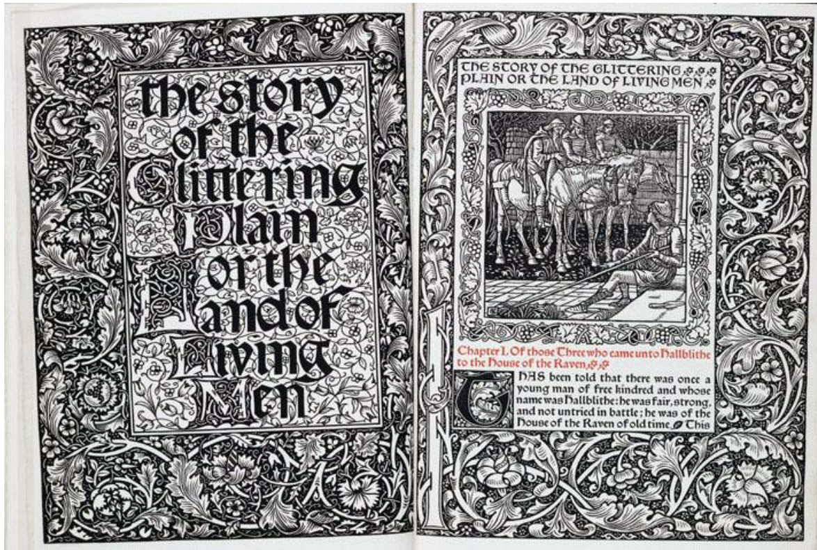
William Morris' fantasy novel "The Story of the Glittering Plain" (1891)