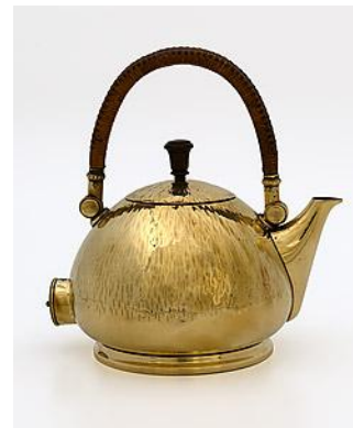
Peter Behrens: Electric kettle (1910)