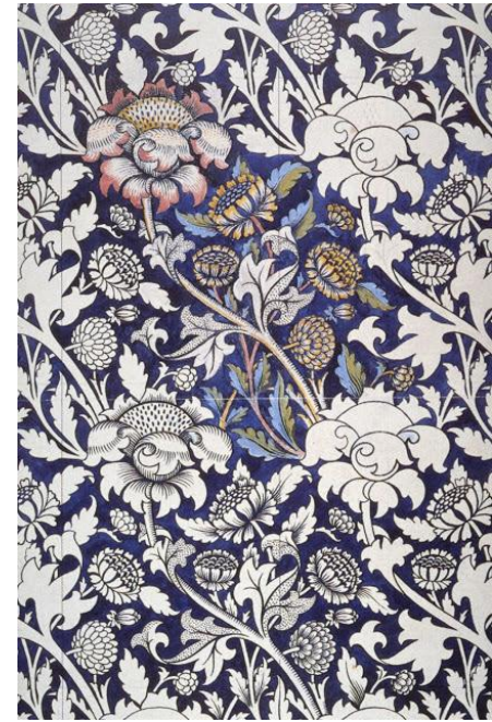
William Morris: “Wey” (1884)