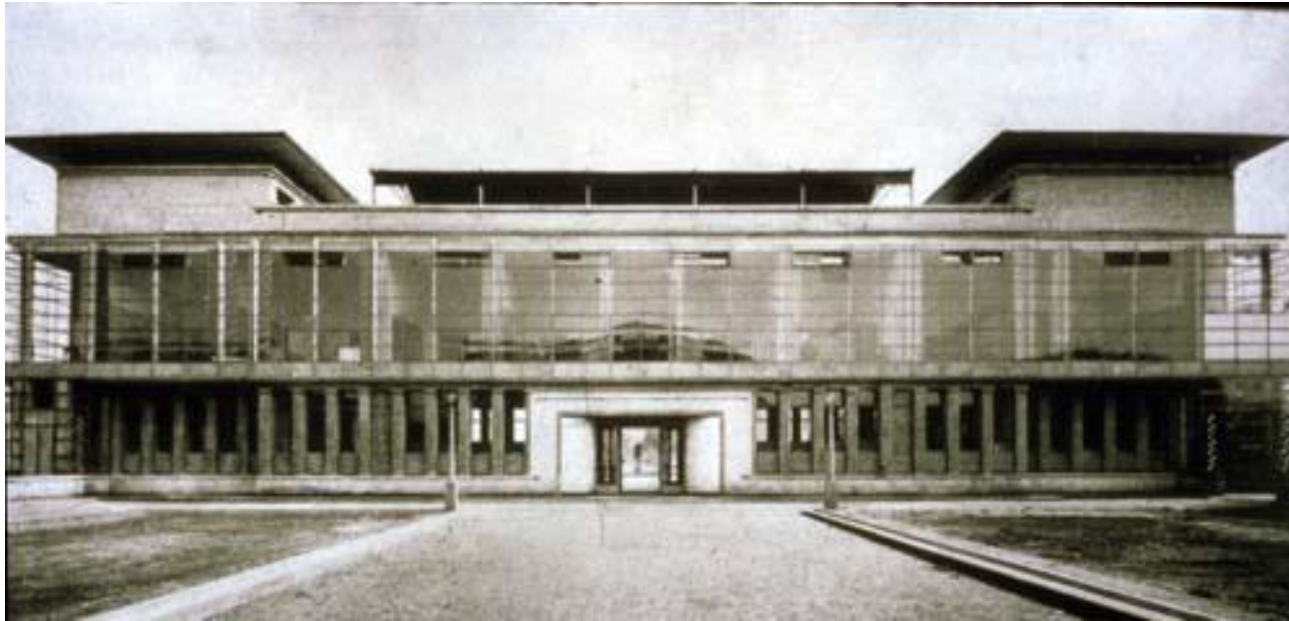
Walter Gropius and Adolf Meyer: Werkbund Pavilion, Cologne (1914)