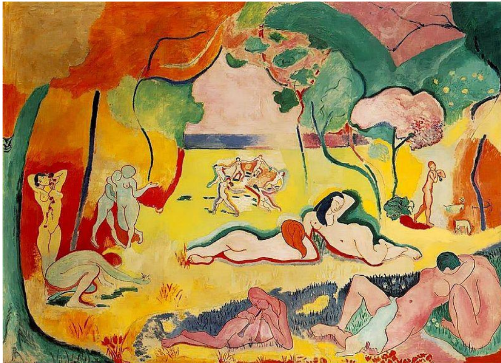
“Le bonheur de vivre” (1905)