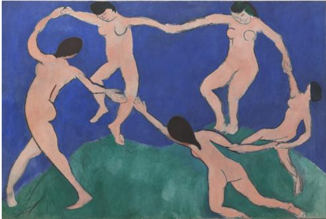
“The Dance” (1909)