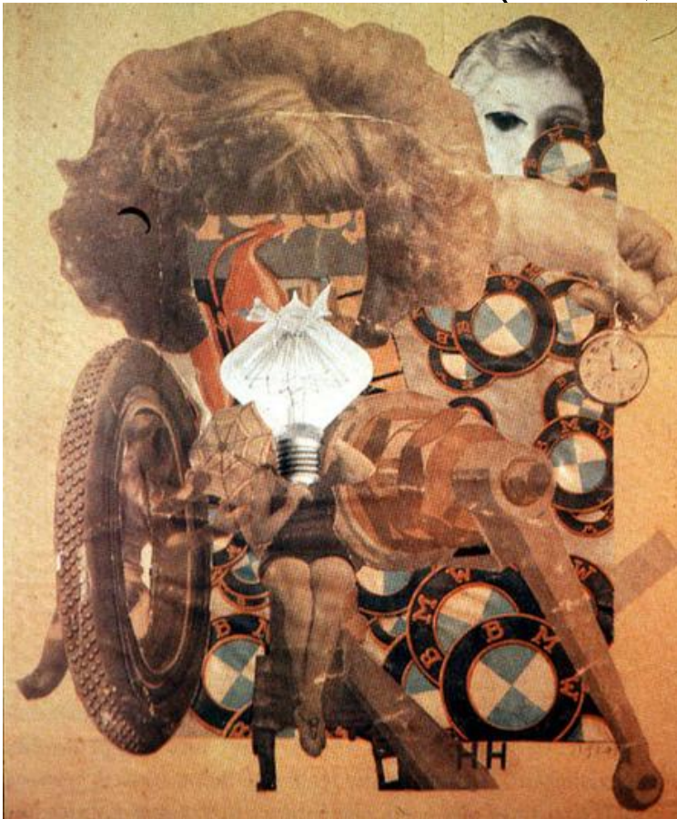
“Beautiful Girl” (1920)