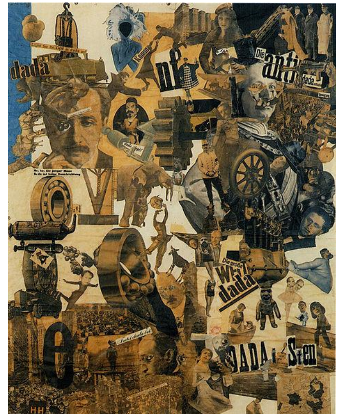
“Cut with the Kitchen Knife through the Beer-Belly of the Weimar Republic ” (1919)