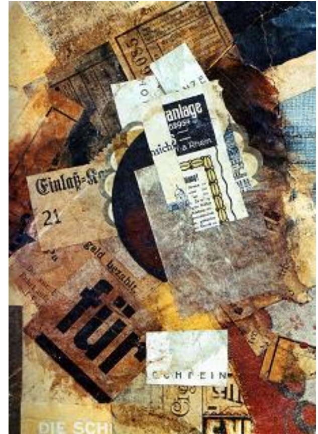
“Merz 94 Grunflec” (1920)