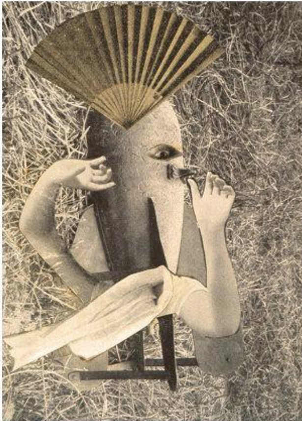
“The Chinese Nightingale” (1920)