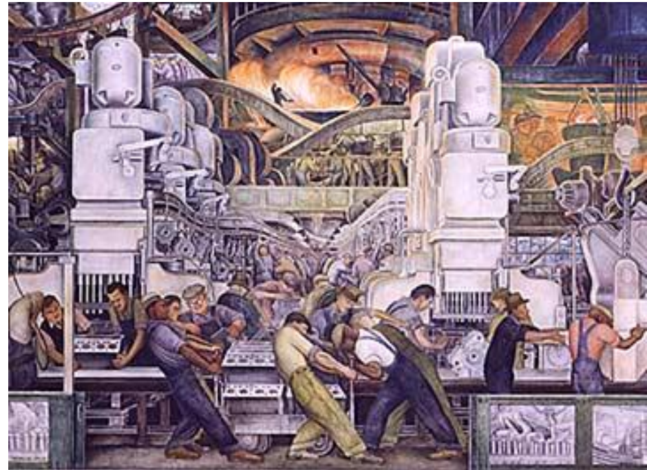
Detroit Institute of Art (1933)