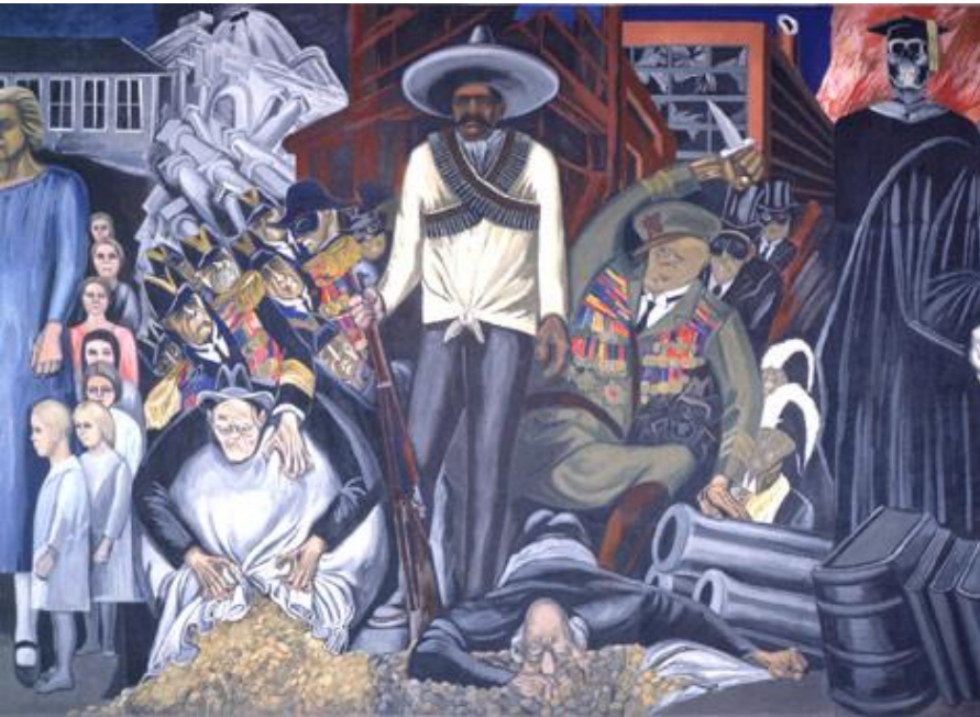
Orozco: “The Epic of American Civilization” (1932)