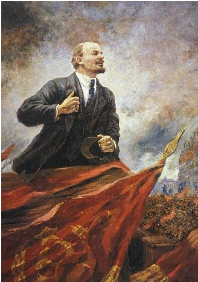
Gerasimov: "Lenin" (1930)