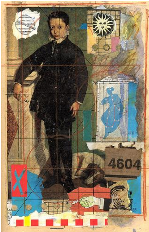
"Medici Slot Machine" (1942)