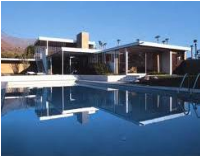
Richard Neutra's Kaufmann House (1946)