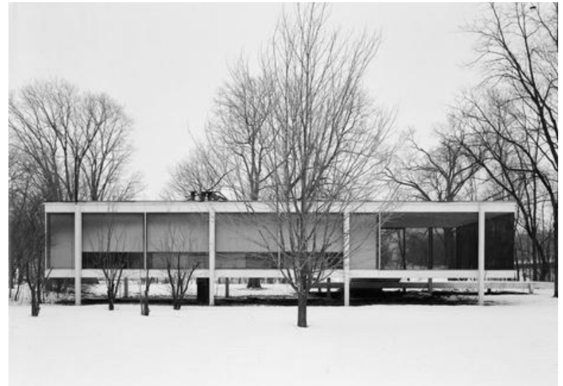
Mies van der Rohe's Farnsworth House (1951)