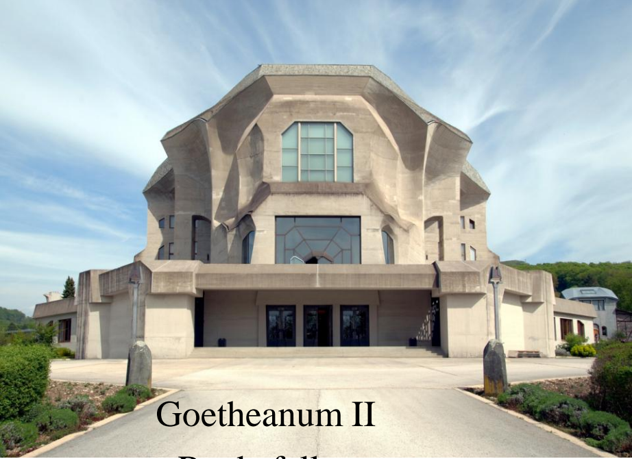
Goetheanum II Rockefeller