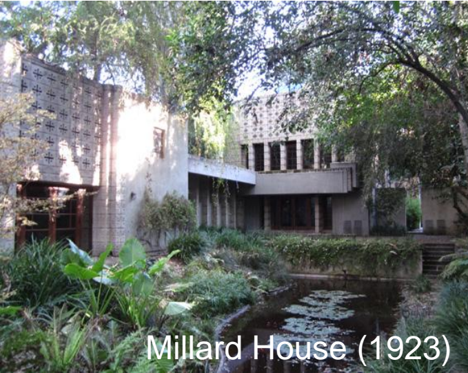
Millard House (1923)