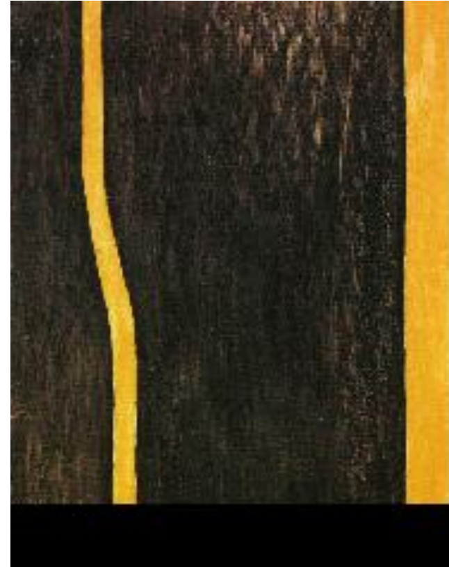
Euclidean Abyss, 1947