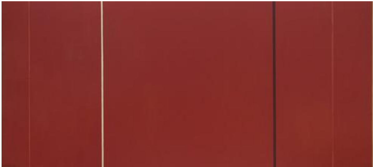
Vir Heroicus Sublimis, 1951