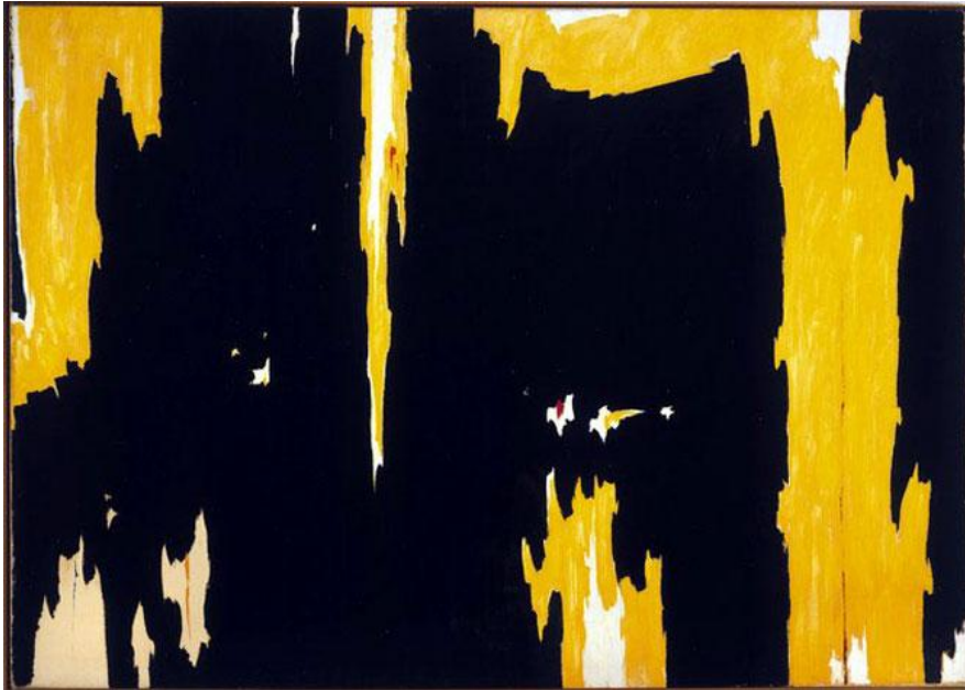
1957-D, No. 1 1957