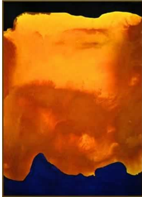
“Magic Carpet” (1964)