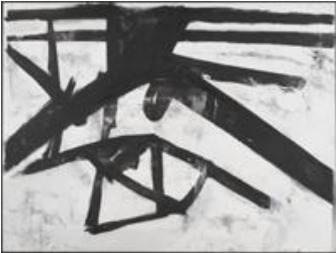
“High Street” (1956)