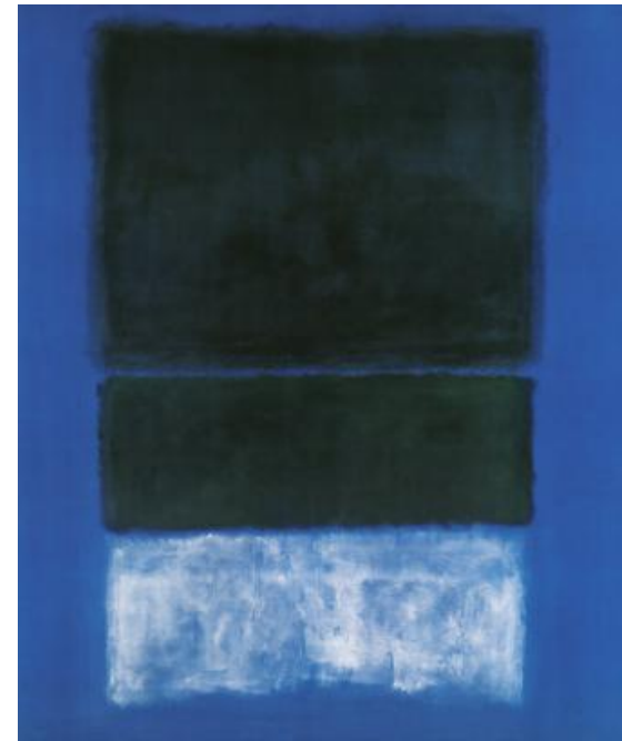
Green and White on Blue (1957)