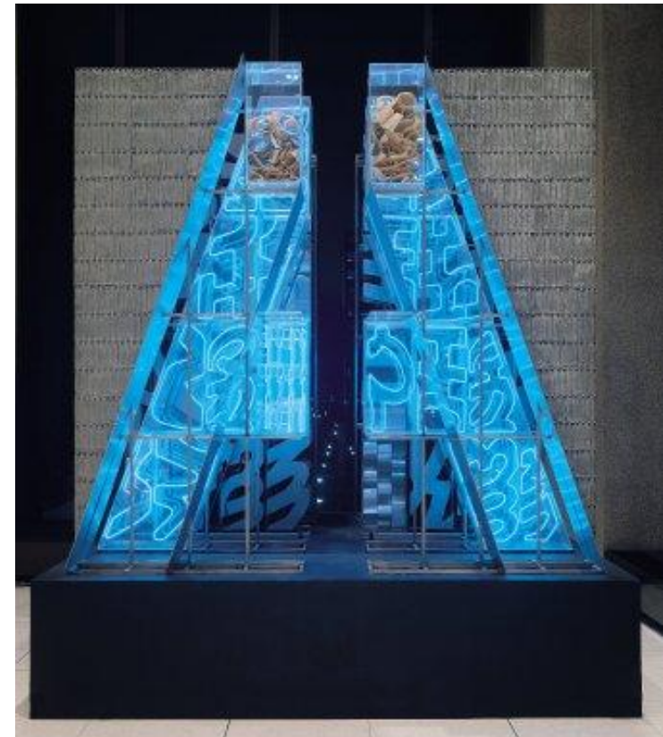
“The Gates to Time Square” (1966)