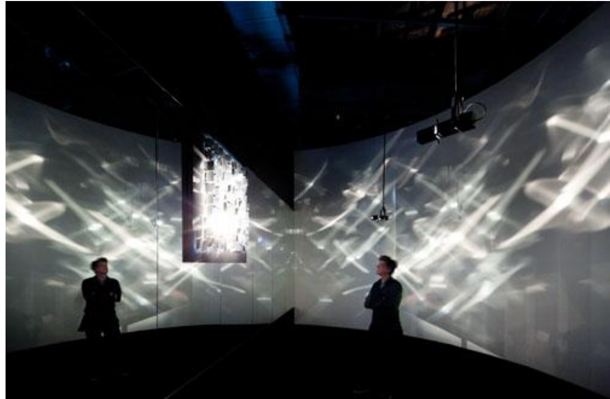
"Lumière en mouvement" (1962)