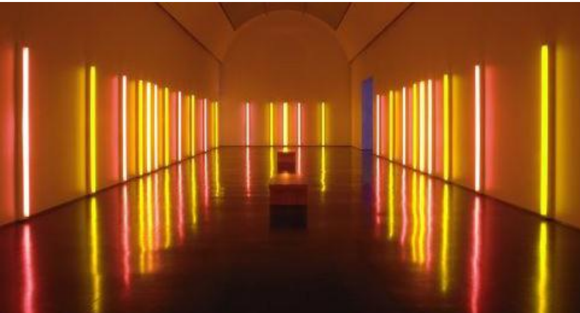
“Alternating Pink and Gold” (1967)