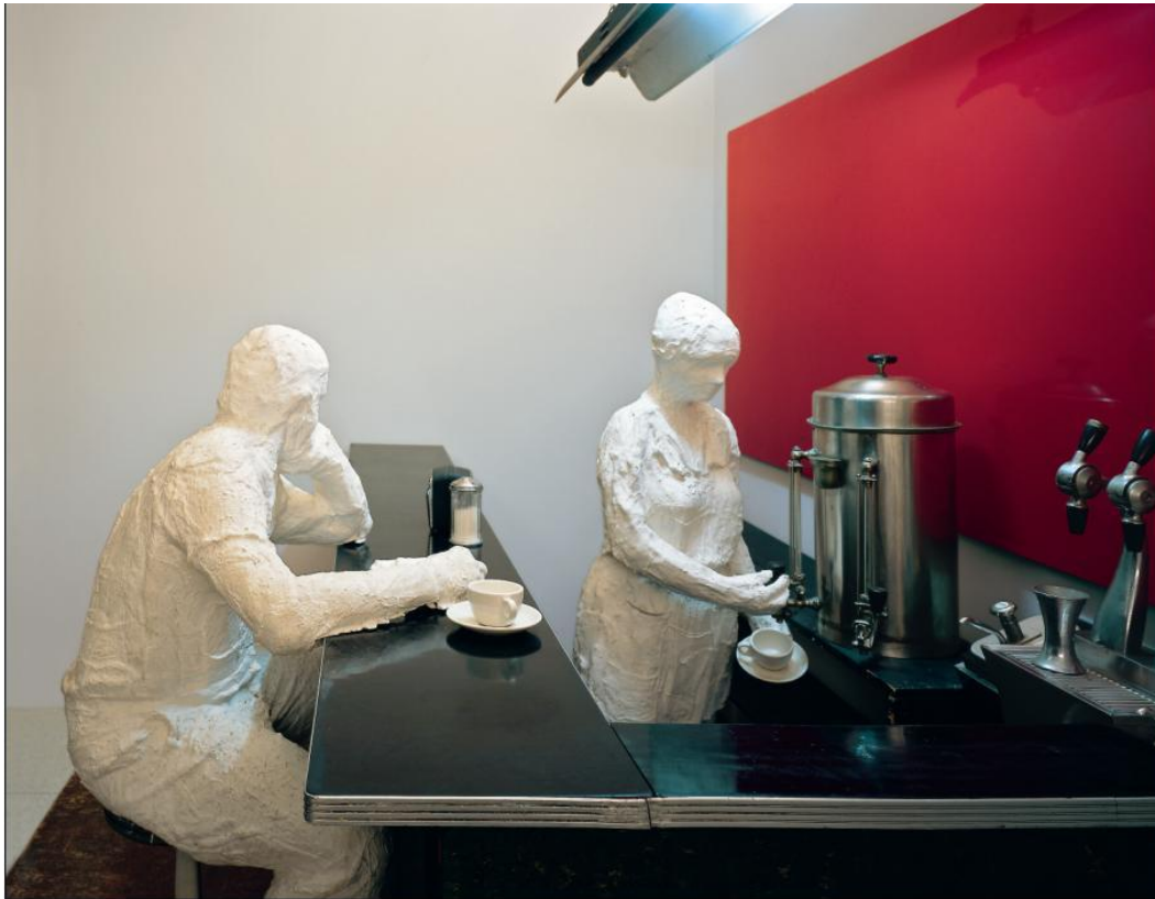
“At the Diner” (1966)