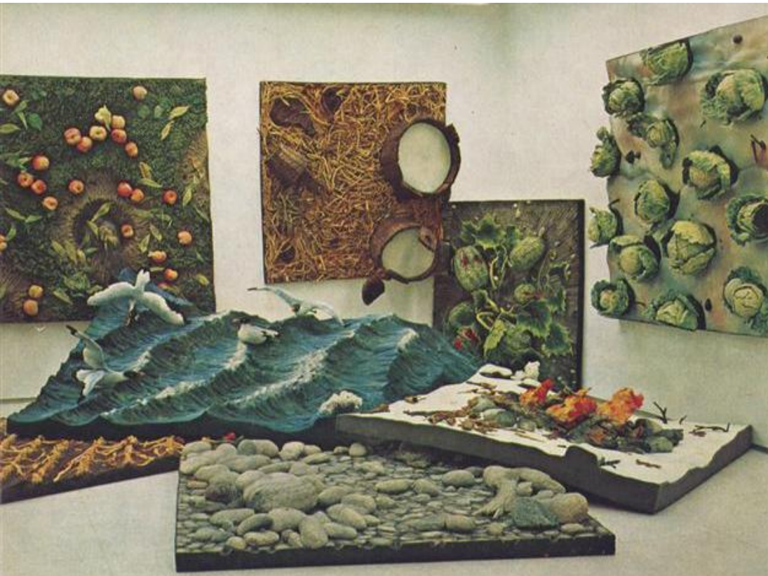
"Nature Carpets" (1967)