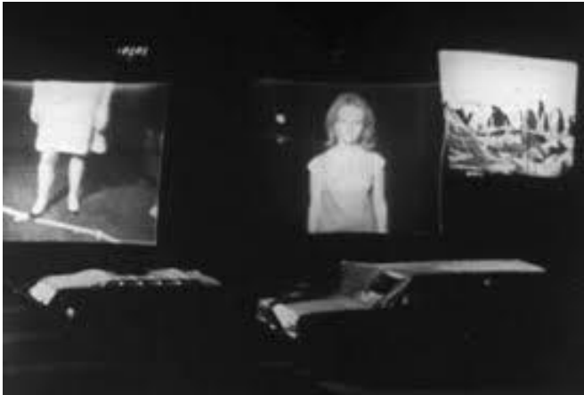
"Two Holes of Water- 3" (1966) Videos and closed-circuit television projections of live performances projected from seven cars