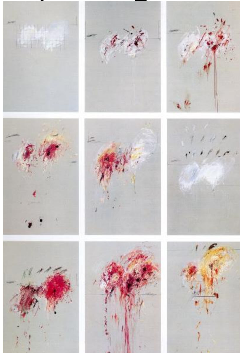
“Discourses on Commodus” (1963)