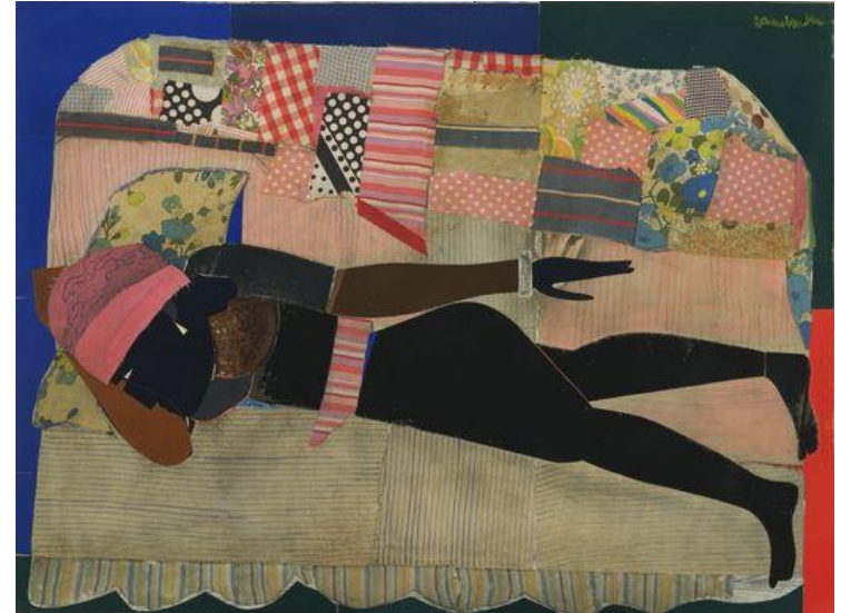
"Patchwork Quilt" (1970)