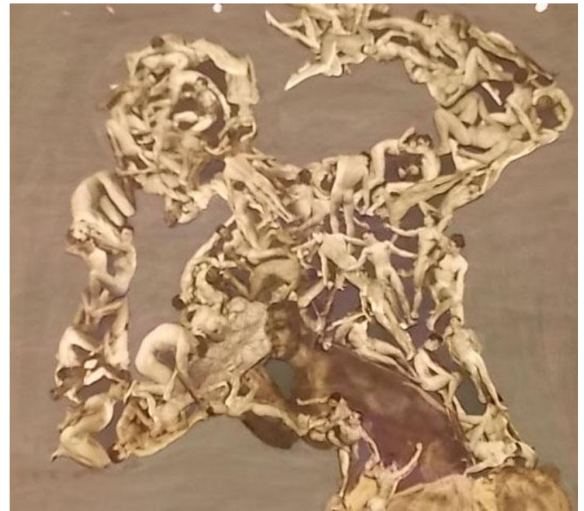
“The Mouse’s Tale” (1954)