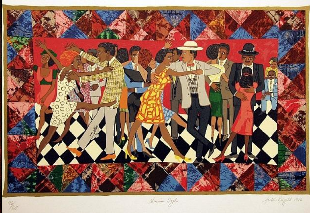
"Groovin High" (1996)