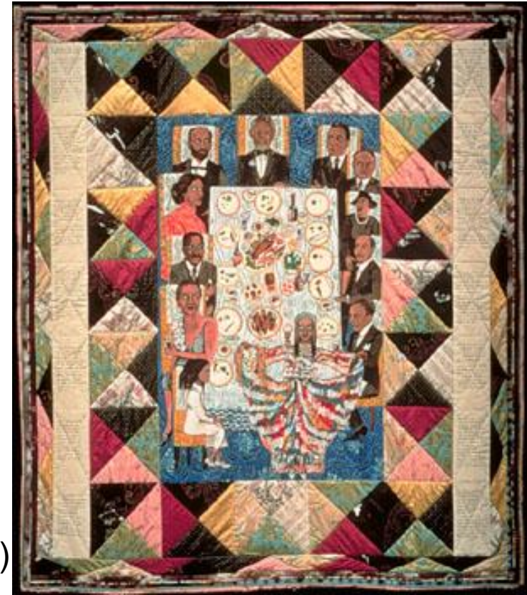
"The Bitter Nest, Part 1: Love in the School Yard" (1987)