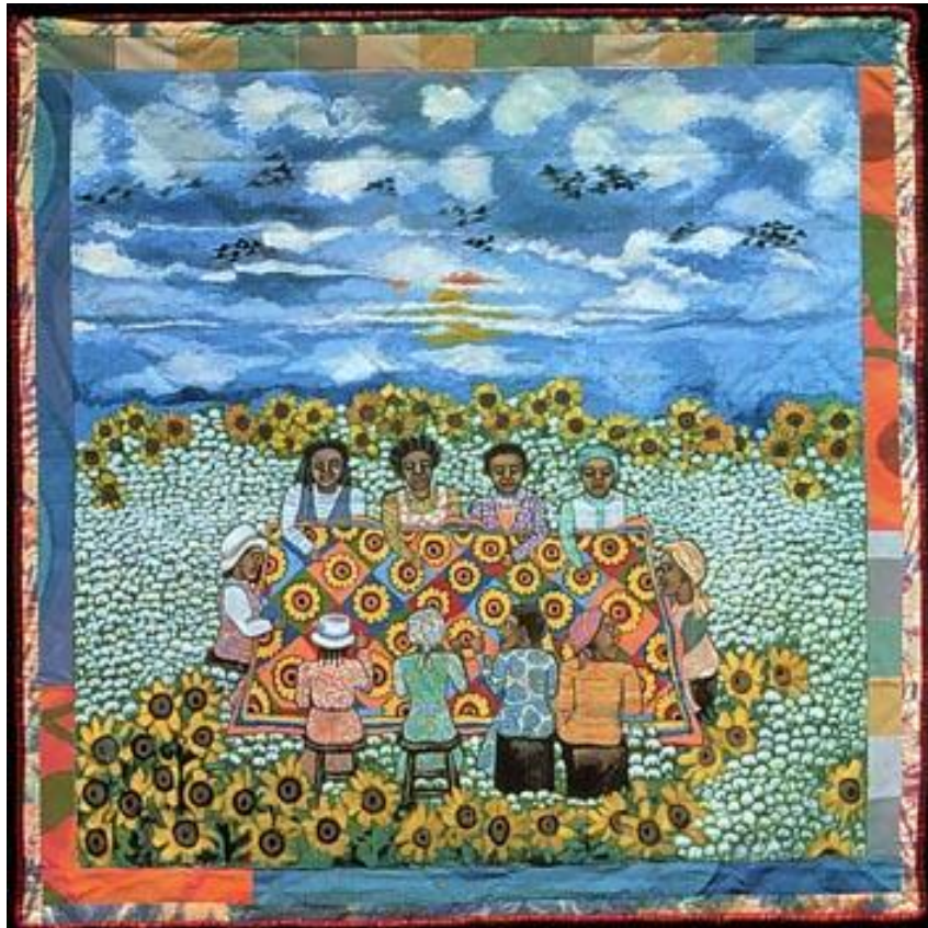
"Cotton Fields, Sunflowers, Blackbirds and Quilting Bees" (1997)