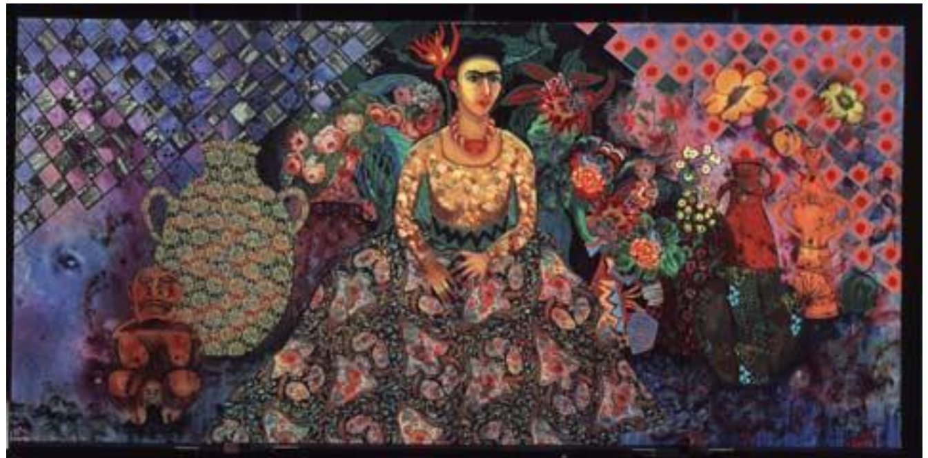
"Portrait of Frida Kahlo" (1988)