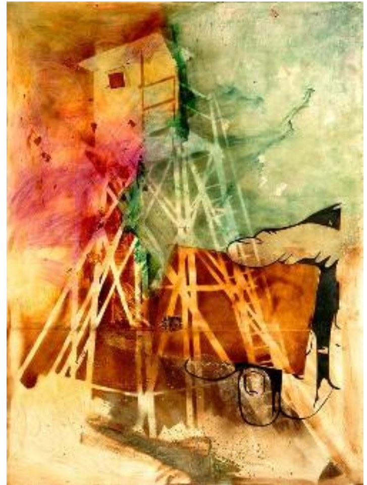
“Watchtower III” (1985)