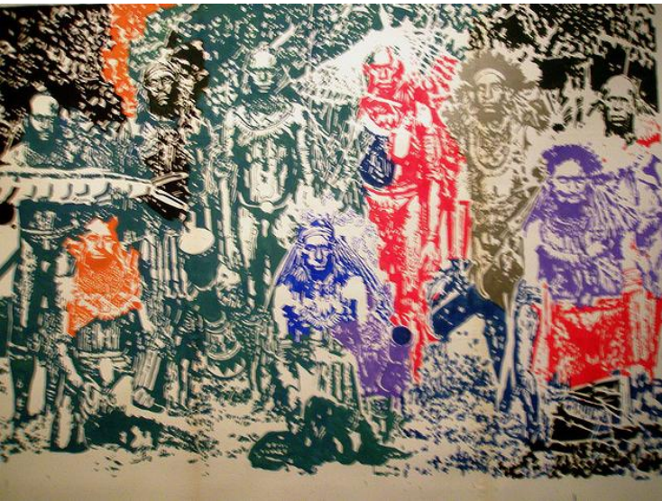
“New Guinea” (1976)