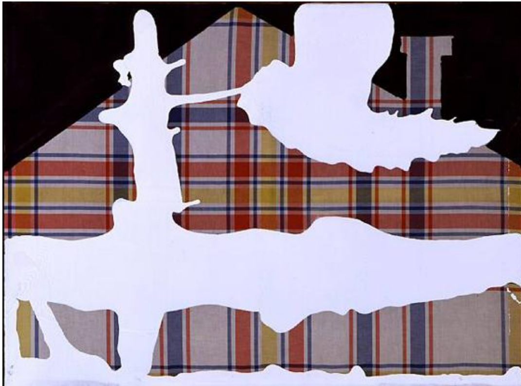
“Das Haus von Mondrian” (1994)