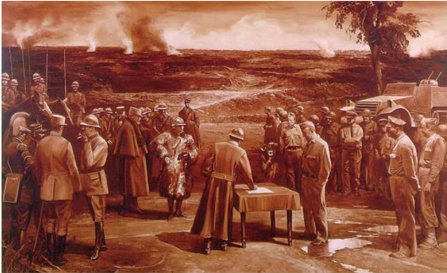
“Triumph of the New York School” (1984)