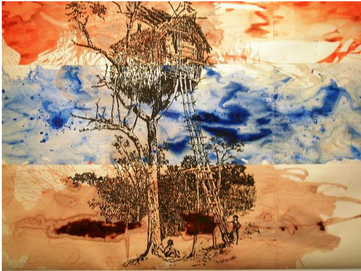
“Tree House” (1976)