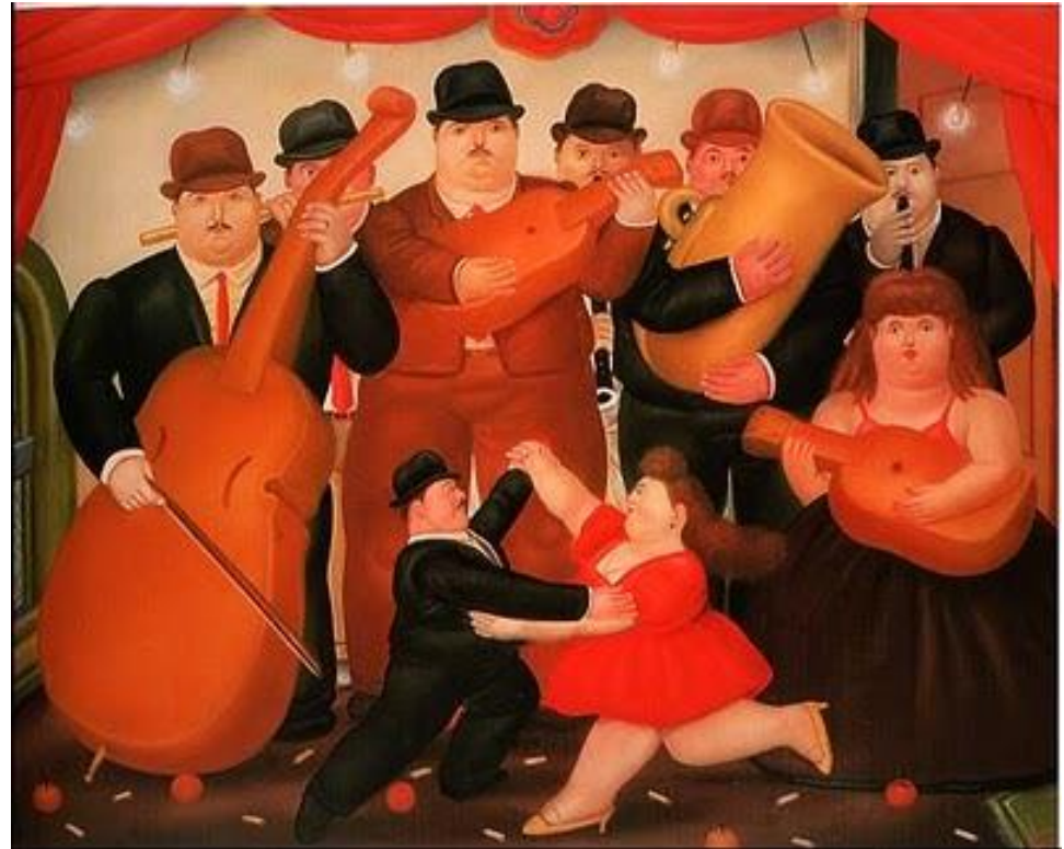
"Los Musicos/ Ball In Colombia" (1980)