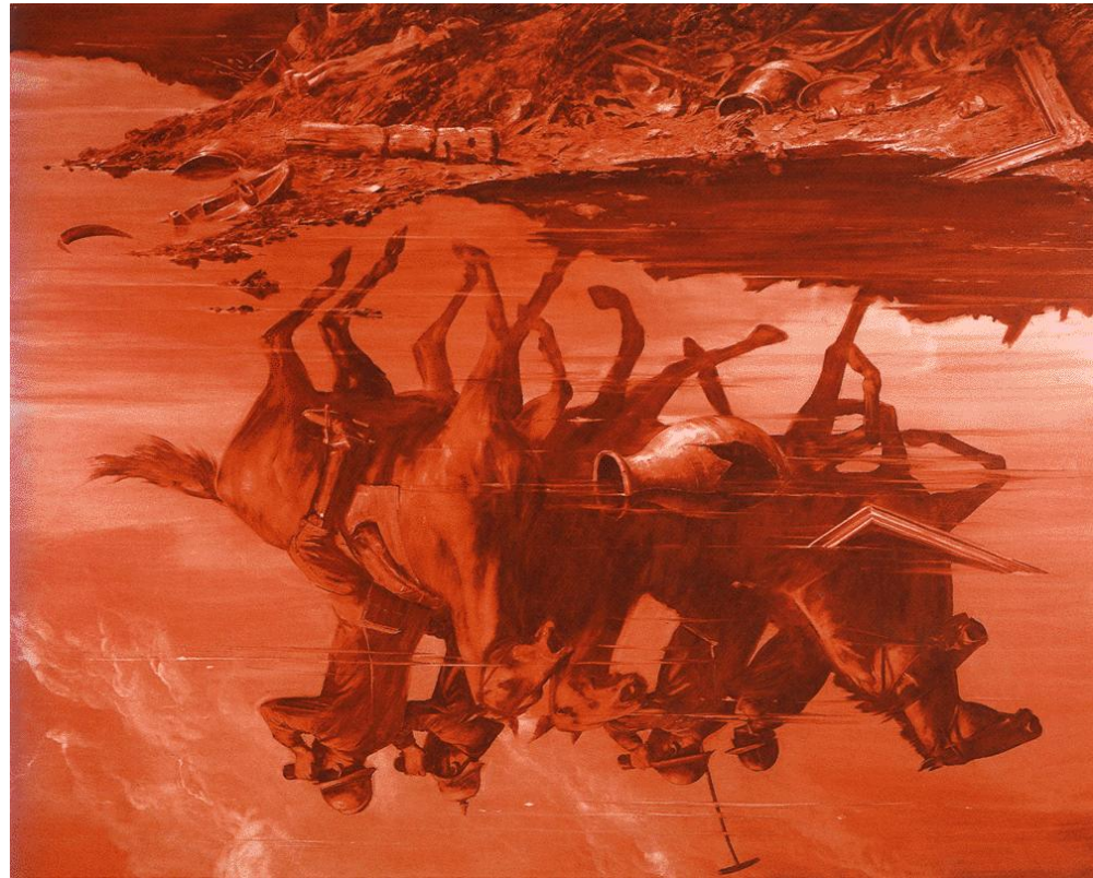
"Forward Retreat" (1986)