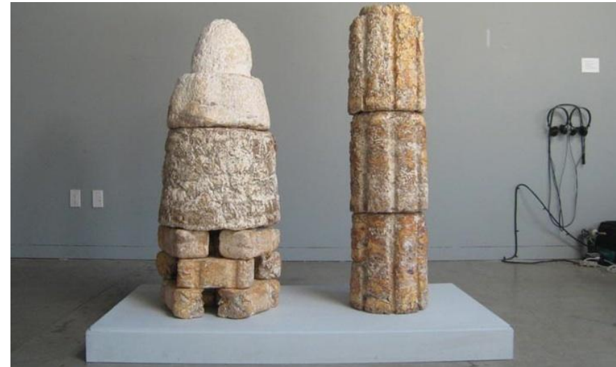
“Mycotecture Series” (2012)