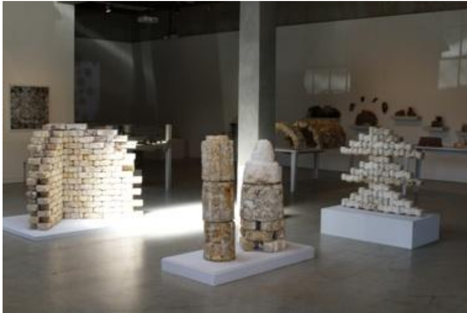
“Mycotecture Series” (2006)