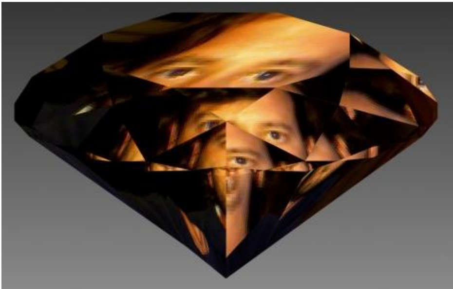
“Ethereal Self” (2008)