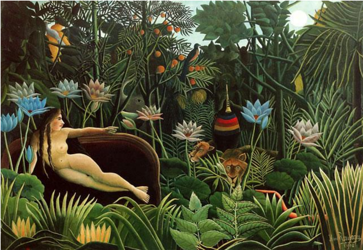
“The Dream” (1910)