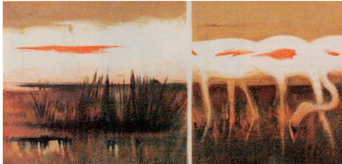
“White Flamingos, Red Flamingos: The Skies They Simulate” (1909)