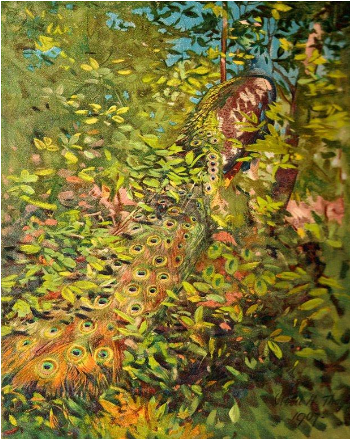
“Peacock in the Woods” (1907)