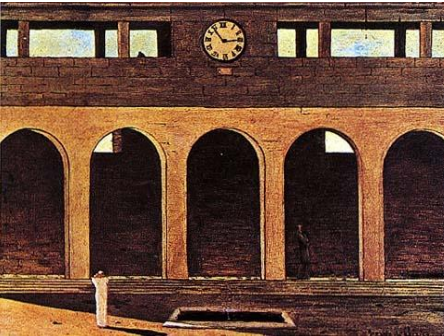
“Enigma dell'Ora” (1912)