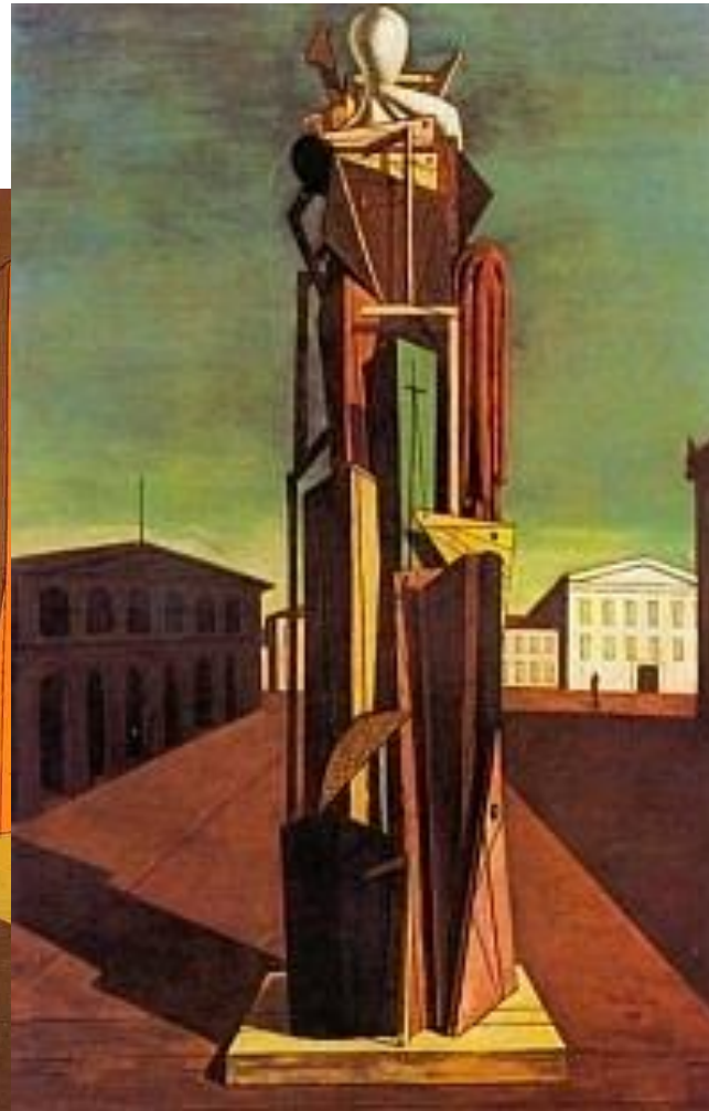
“Il grande metafisico” (1917)