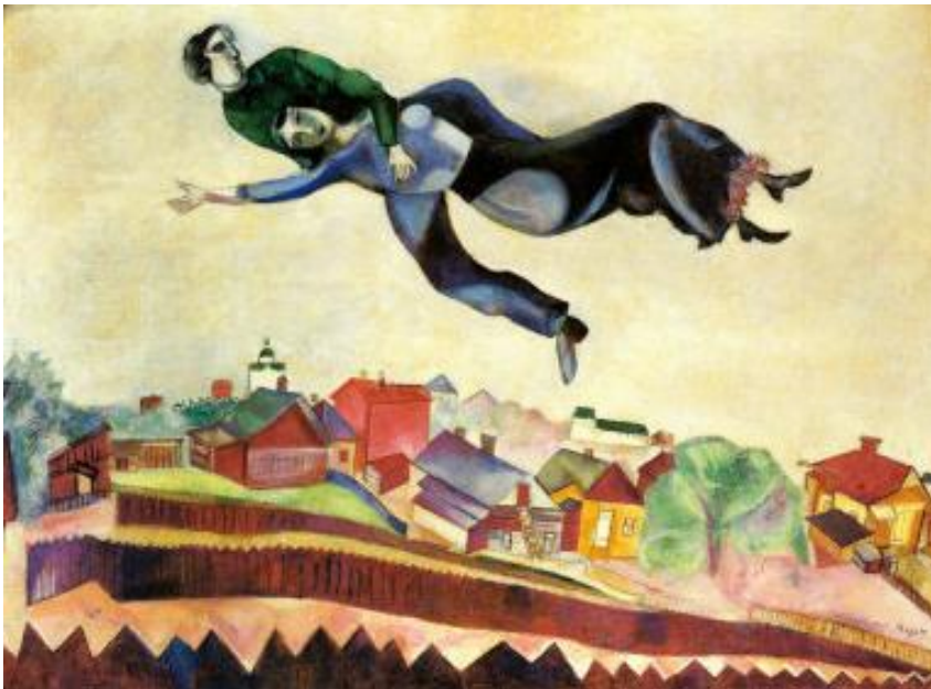
"Au Dessus de la Ville" (1924)