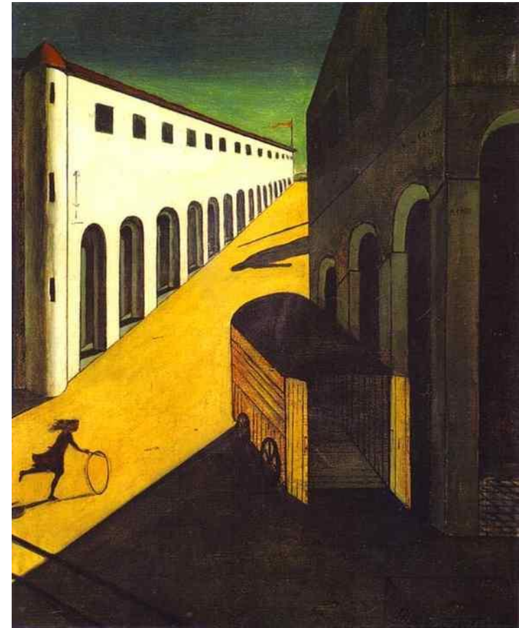
“Melancholy and Mystery of a Street” (1914)