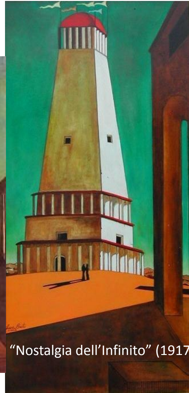
“Nostalgia dell'Infinito” (1917)