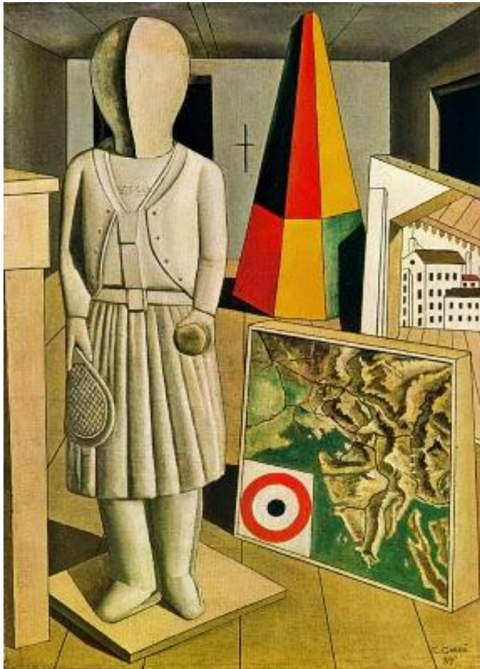
“The Metaphysical Muse” (1917)