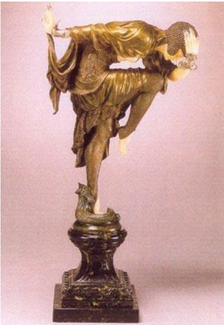
Claire Colinet's "Ankara Dancer" (1924)