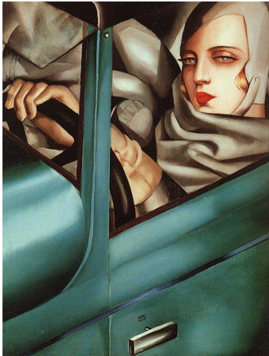
“Self-Portrait in Green Bugatti” (1925)