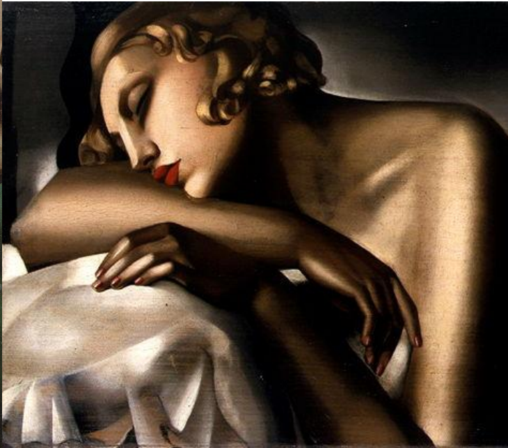
“The Sleeping Girl” (1930)