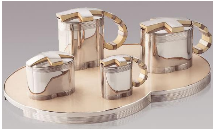
Jean Puiforcat's kitchenware