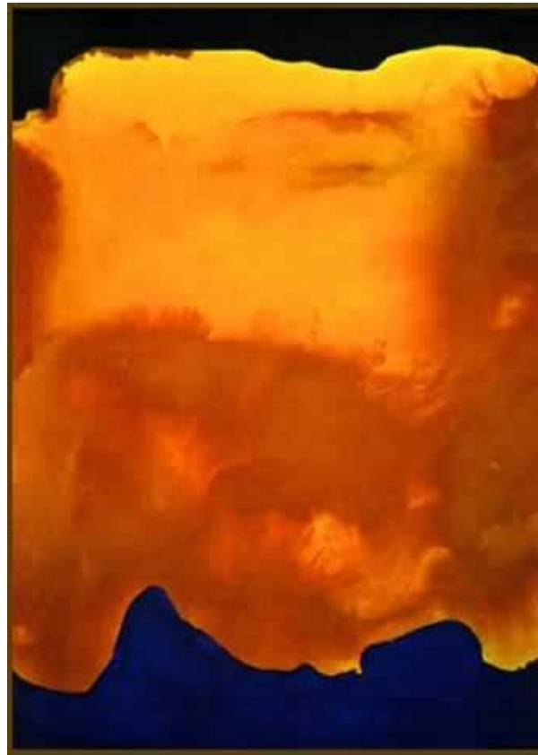
"Magic Carpet" (1964)