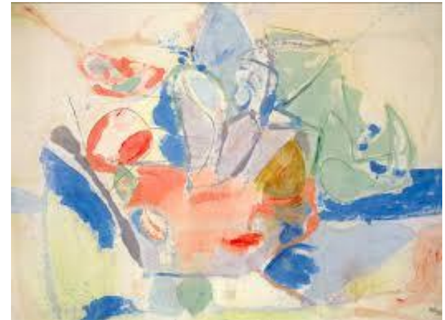
"Mountains and Sea" (1952)