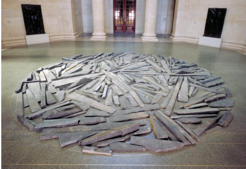
"Slate Circle" (1979), stones picked up during a 100 km walk

"A Line Made by Walking" (1967), walking as an art